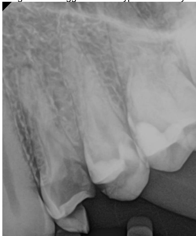
Figure 1 - Canal lumen only in the cervical third of the root, the contour of the periodontal ligaments suggested an atypical anatomy.

In the pulp sensitivity test to cold, the patient exhibited a positive and exacerbated response and there were no periapical symptoms (palpation and percussion). After the diagnosis of irreversible pulpitis, the patient was anesthetized using 2% lidocaine with epinephrine 1:100,000 (DFL). Next, the cariated tissue was removed and the distal wall was lifted with direct opalis flow (FGM) resin. Next, coronary access was performed with a