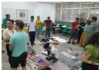
Figure I – Moment of the exchanges made by the participants of the fair