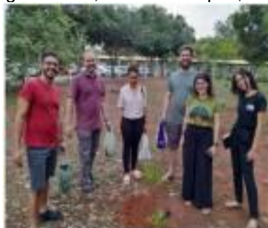
Figure II – Planting of fruit tree seedlings at IFTTO, Palmas campus, carried out by the students of the course.