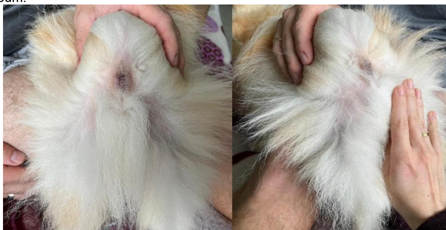
Figure 1: Images of the patient presenting bilateral symmetrical hair thinning on the caudal aspect of the thighs and perineum.

Dermatological evaluation revealed primary hair loss and hair thinning on the caudal side of the thighs and bilateral perineal area. The rest of the body was inspected and did not show any other areas of alopecia or other alterations. The skin showed no signs of inflammation, such as redness or crusting, and was normal in color and appearance (figure 1).