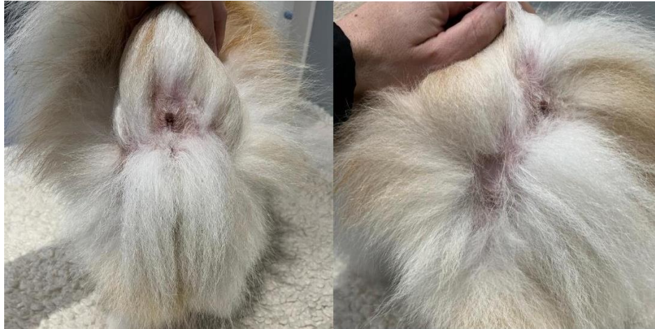
Figure 2: images of the alopecic areas showing partial hair regrowth after 90 days of treatment.

Given the partial positive result of therapeutic response, the use of melatonin was extended for another 2 months, together with the Qpelo food supplement to aid in hair growth, until further instructions.