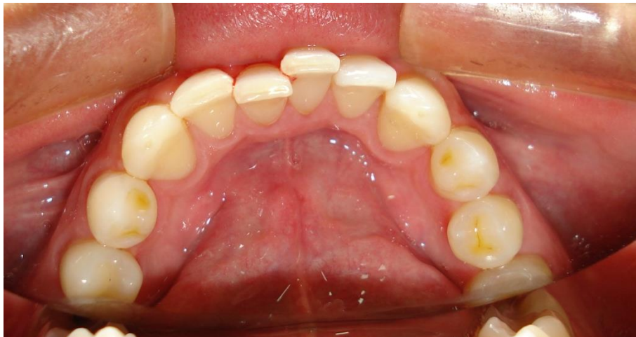
Picture 5- Photo of final smile.