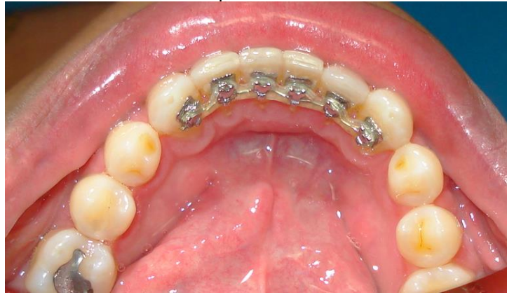
Picture 7- Final photo of maxilar view.