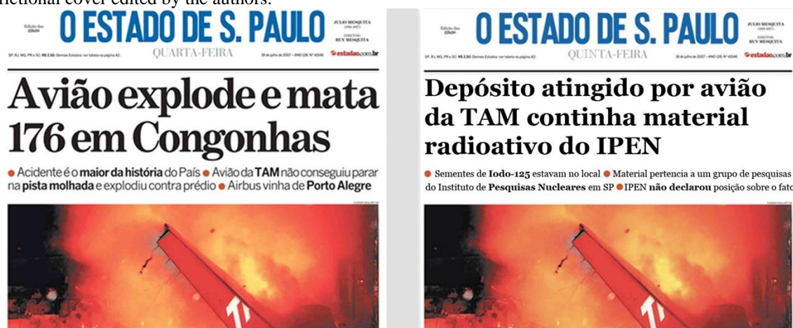
Figura 1 - Montage with cover of the newspaper "O Estado de São Paulo" of July 17, 2007. On the left, original cover and on the right, fictional cover edited by the authors.

Managing this flow is a major challenge in our age. Scholars note that since the 20th century, with the strengthening and rapid dissemination of Digital Information and Communication Technologies (ICTs), there has been the possibility of a disorderly production and dissemination of an exponential amount of new content. This factor generates an overload of information, which makes it difficult to handle the so-called “strategic” information.