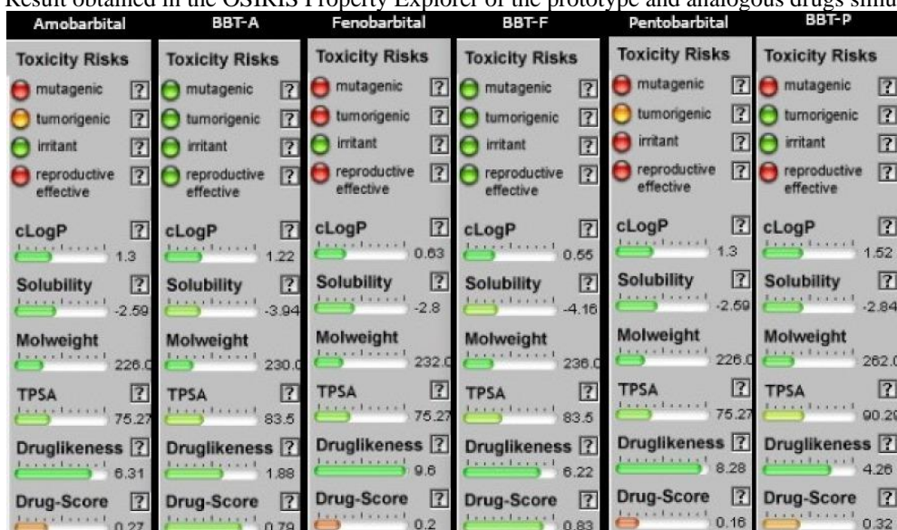
Figure 3 – Result obtained in the OSIRIS Property Explorer of the prototype and analogous drugs simultaneously.