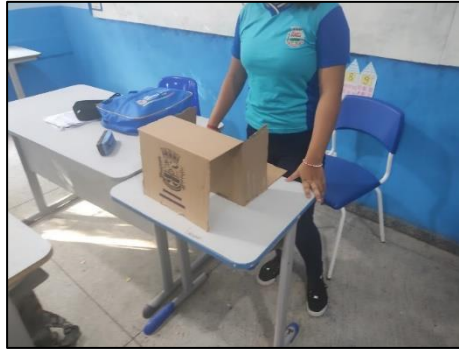
Figure 1. Student making his vote.