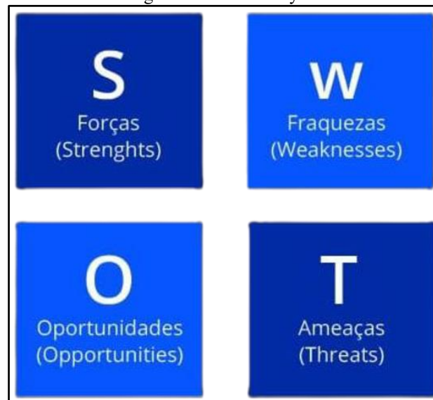
Figure 1: SWOT analysis.