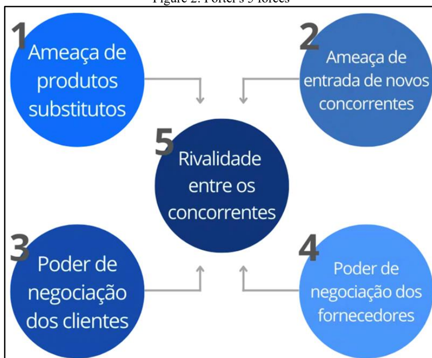
Figure 2: Porter's 5 forces